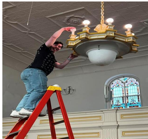
Putting Monkey Boy to good use before heading back to University!!!